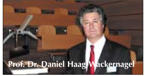
Europe's leading pigeon control expert tutoring in all 3 countries, mentioned

A chain of international workshops in Britain, Germany and Switzerland within the last 9 months resemble the growing importance of bird control for the urban environment. The main focus, not surprisingly, was on feral pigeons. It is now widely accepted that in the present human behavioural situation, feeding by birdlovers and consumption of fast food left plenty of rubbish in city streets - for a growing number of pigeons. Therefore it may be tolerated by the public, that a limited number of birds is eliminated.